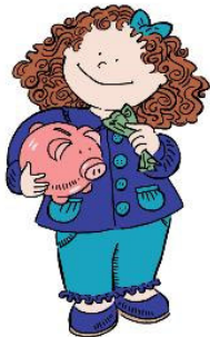
Habitat House Banks

an Advent Penance Service along with Holy Cross Parish and Saint Paul Parish.